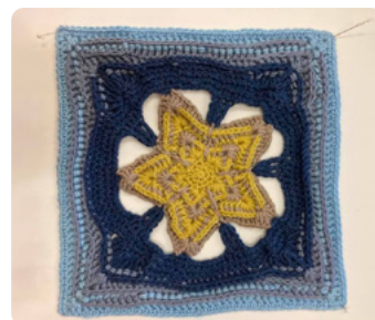
Completed block in Colorway 2