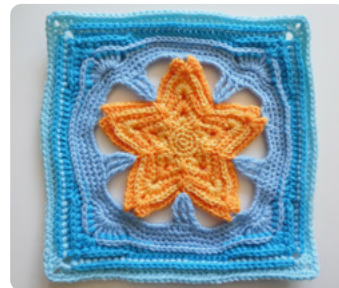
Completed block in Colorway 1