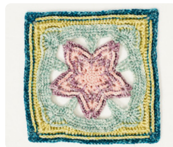
Completed block in Colorway 3